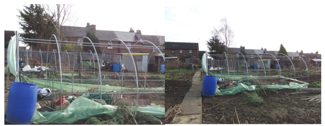
A couple of photograph taken showing some of the destruction caused by last year's storms to the allotment.